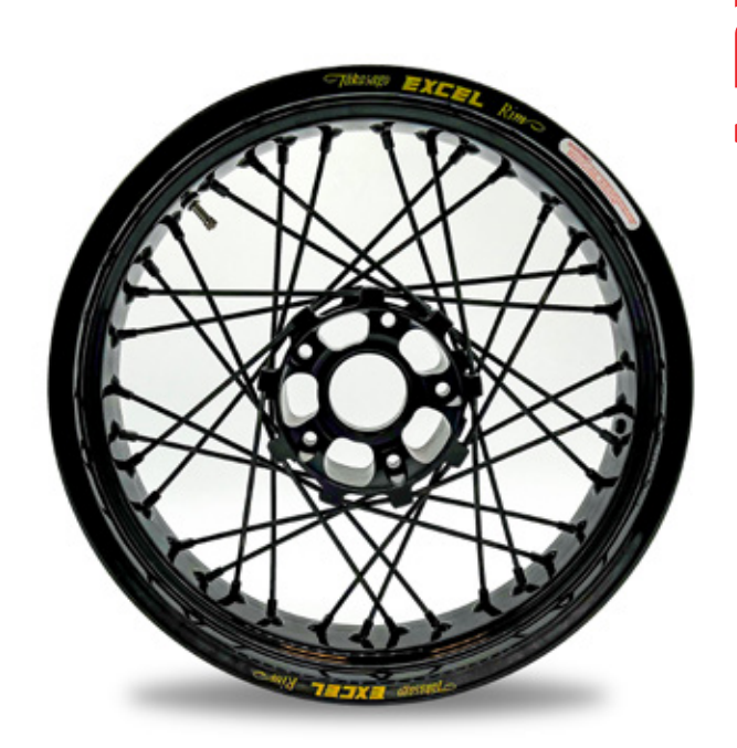
ADV WHEELS AVAILABLE FOR KTM, HUSQVARNA, DUCATI, GASGAS, BMW, BETA, HONDA, KAWASAKI, SHERCO, SUZUKI & YAMAHA